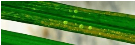
Rice is a staple for half the world's population and the model plant for grass-type biofuel feedstocks

A bacterial signal that when recognized by rice plants enables the plants to resist a devastating blight disease has been identified by a multi-national team of researchers led by scientists with the U.S. Department of Energy (DOE)'s Joint BioEnergy Institute (JBEI) and the University of California (UC) Davis.